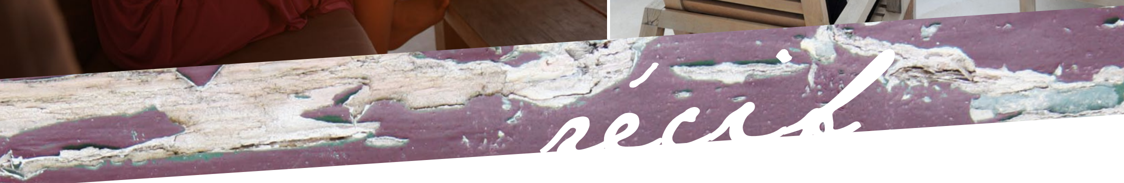
from left to right: cocktail at sundowner, cosy corner